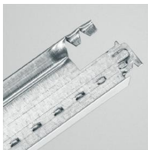
KONSTRUKCE 24 TL